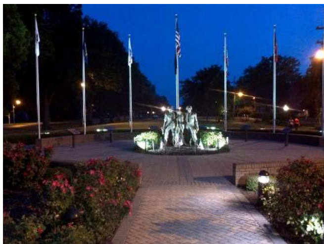
The Vietnam Soldiers Statue at the Tunica Veterans Memorial.