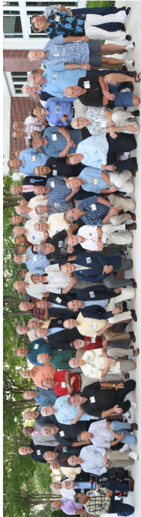
Group photo of the veterans who attended the 2013 reunion of the Hill 4-11 Association in Tunica, MS.