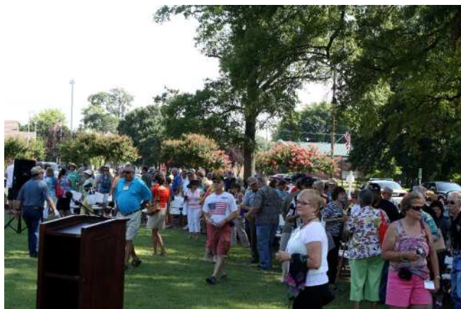
Veterans and their families at the memorial service.