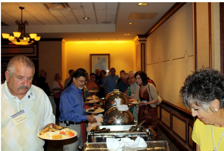
The buffet line at the banquet.