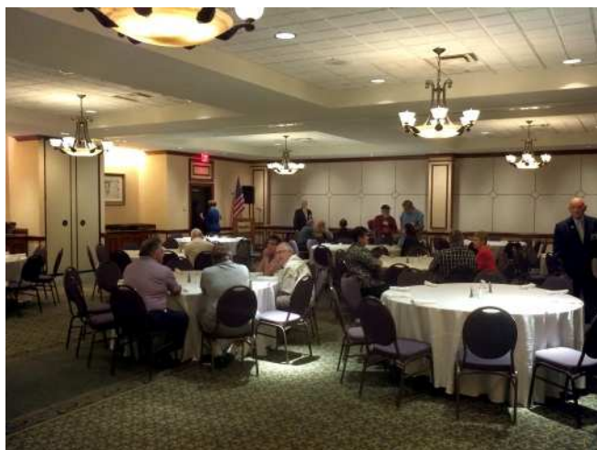
Social hour prior to the banquet.

If you want your pictures from the Vietnam era or the 2013 reunion posted on the hill4-11.org web site or in a future newsletter, please email a digital copy to webmaster@hill4-11.org or send a DVD/CD copy of them to Charlie Wood, 221 Pinewood Circle, Goldsboro, NC 27534