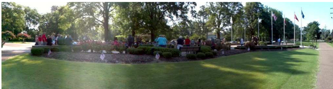
Panoramic view of the Veterans Memorial in downtown Tunica, Mississippi.