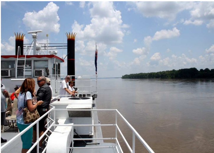
Cruising on the Tunica Queen.