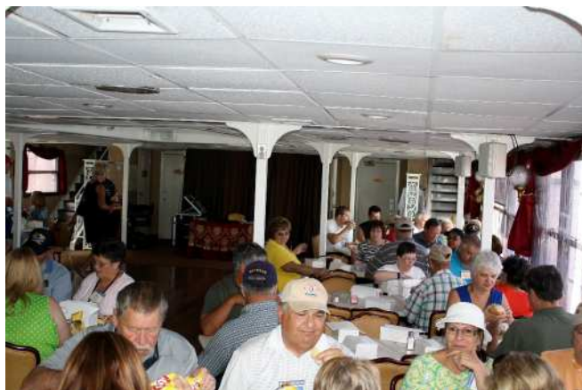
Dining on the Tunica Queen.