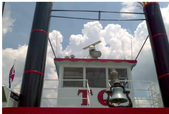
The pilot's control room on the Tunica Queen.