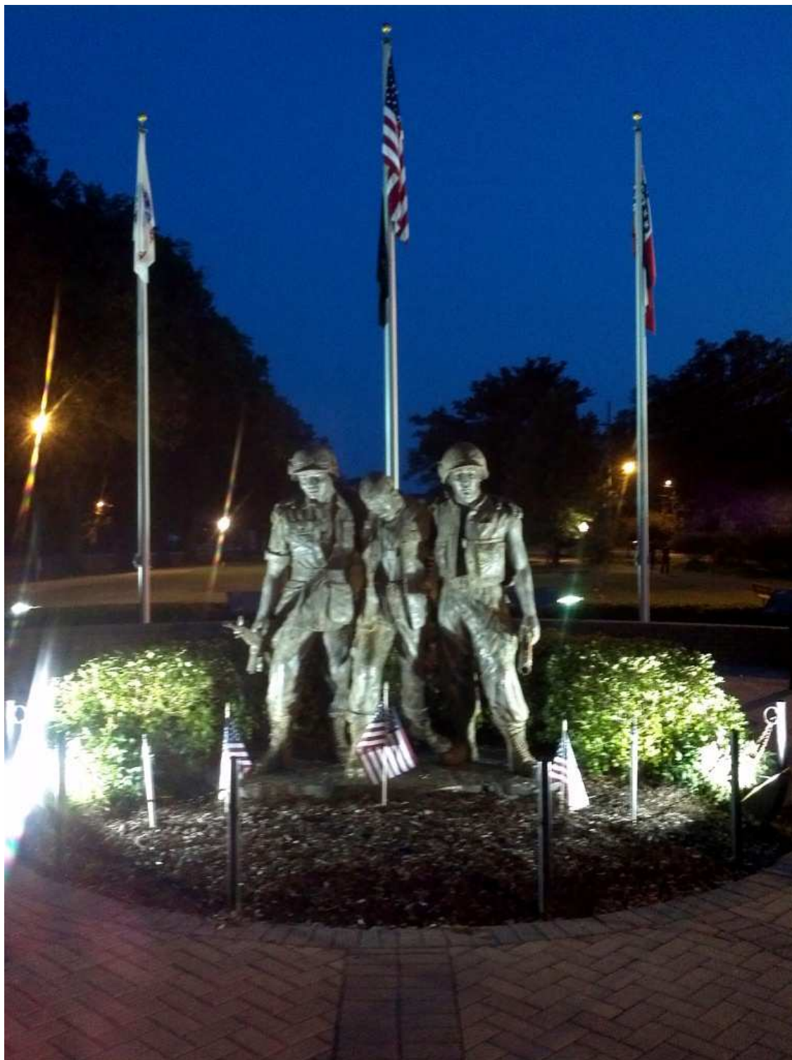
Vietnam Soldiers Statue at the Veterans Memorial Park in downtown Tunica, Mississippi.