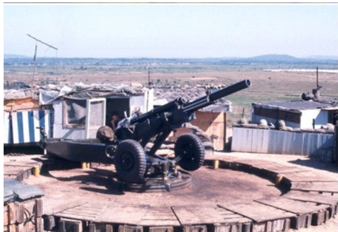
Hill 4-11